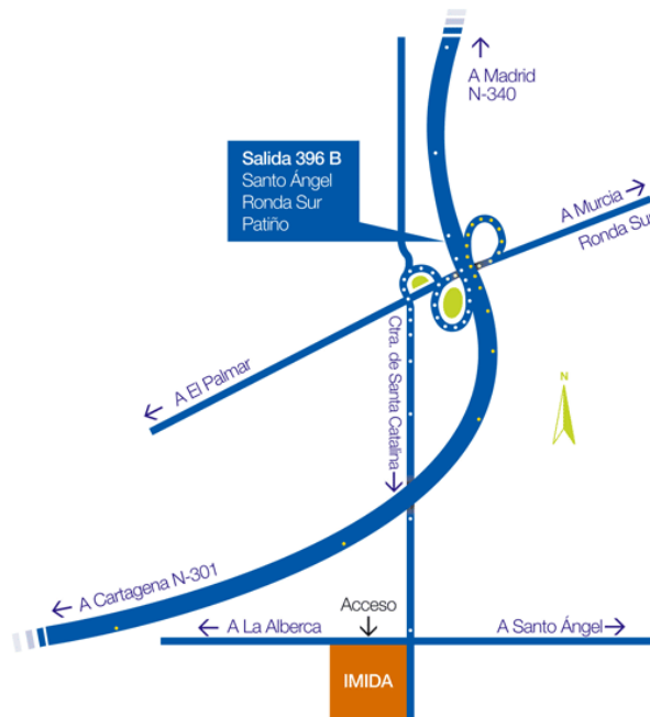
Localization of IMIDA (Autovia A30-Salida 396B)

Teléfono Hotel Casa Emilio ( C/ Alameda de Colon N° 9 ): 968.221.783